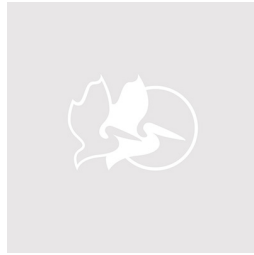
9483 Power Supply